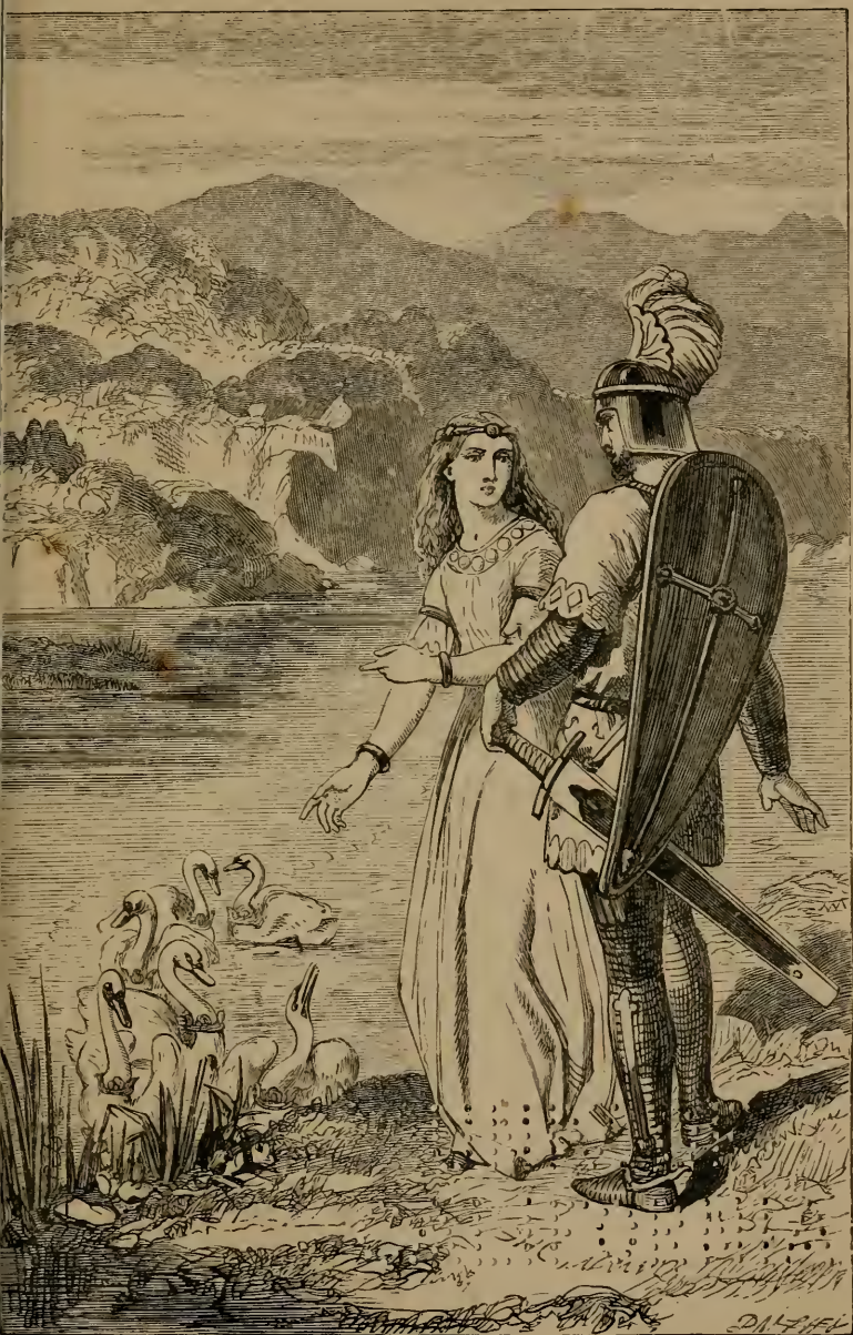
St. Anthony of Italy.